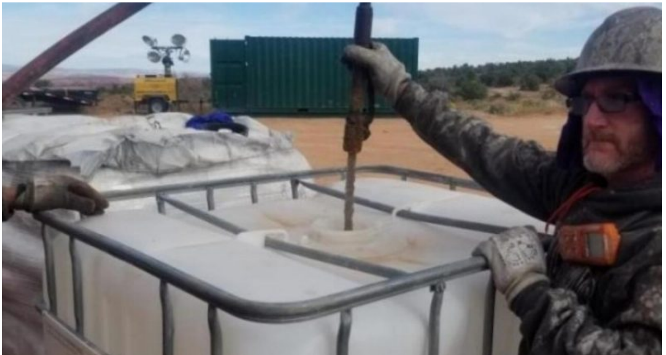
Brine from the top of the Mississippian units.